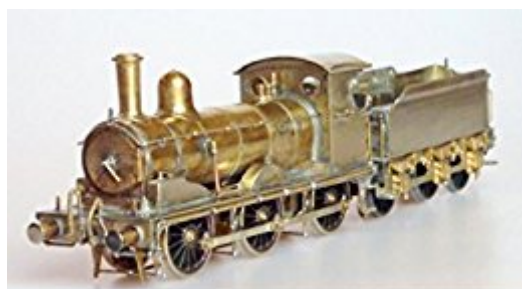
Scratch-Building Model Railway Locomotives